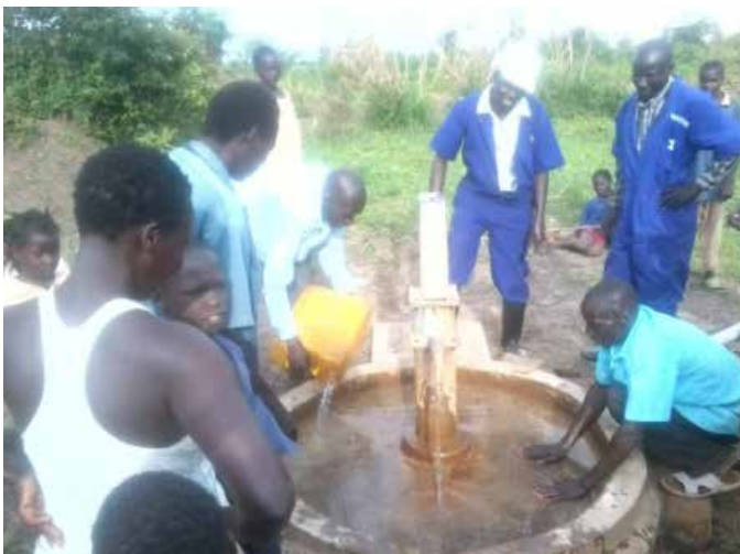
■ Restauration of a borehole

“With positive printing you help the environment and improve the lives of the people involved.”