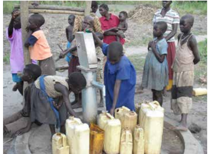
Children of the Kole district collecting water from a borehole

The impact of this project is profoundly felt by women and children in particular, who are responsible for the daily chore of collecting water. Without a properly maintained supply in the community this can often be really tough, involving long distances away from the village carrying heavy loads.