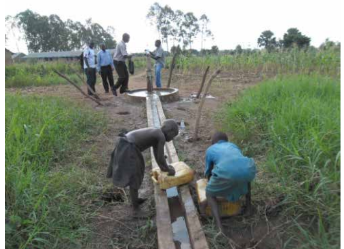
■ A borehole repaired by CO2balance

By supporting these projects through carbon finance co2balance clients are helping to prevent disease and support communities to help themselves.